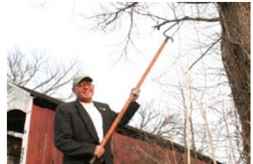
Graham and The SAW stopped at this covered bridge in Parke County, Indiana, the covered bridge capital of the world.